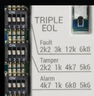
Built in EOL resistors