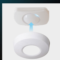
Ceiling mount cover