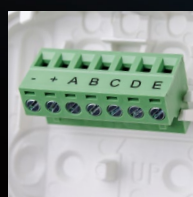
Adjustable terminal block