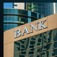
Banking & Finance

Capture motion detectors excel in a wide variety of professional security applications.